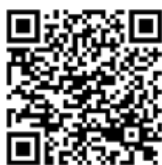
Kate Every. College Nurse

Please complete the online consent form via the following link , as soon as possible, or via the QR code below: