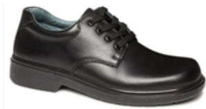
Black Lace Up School Shoe