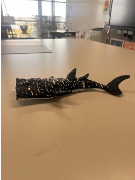
Shark – Asha Read

Our Year 8 Art students have been working on a Tin Can challenge. It has been wonderful to see how creative our students can be!