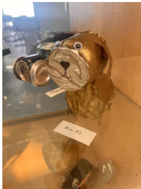
Dog – Olive Beadle