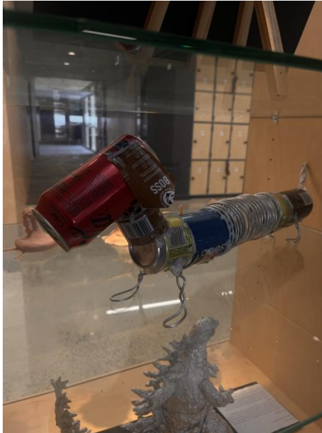
Slinky Dog – Liam Hawkes